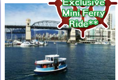
Scenic mini ferry