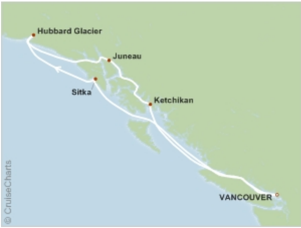
Not a cruise itinerary map, for regional reference only.